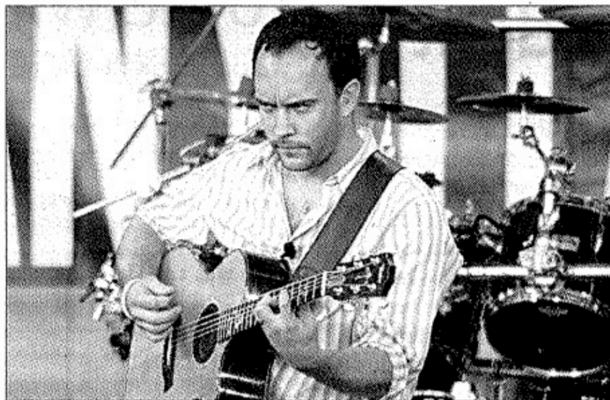
DAVE MATTHEWS , above, and his band will perform at a Sept. 12 benefit concert in Denver. Hilary Duff, right, is one of several celebrities to donate large sums of money.

Nicolas Cage, who has a home in New Orleans, pledged $1 million.