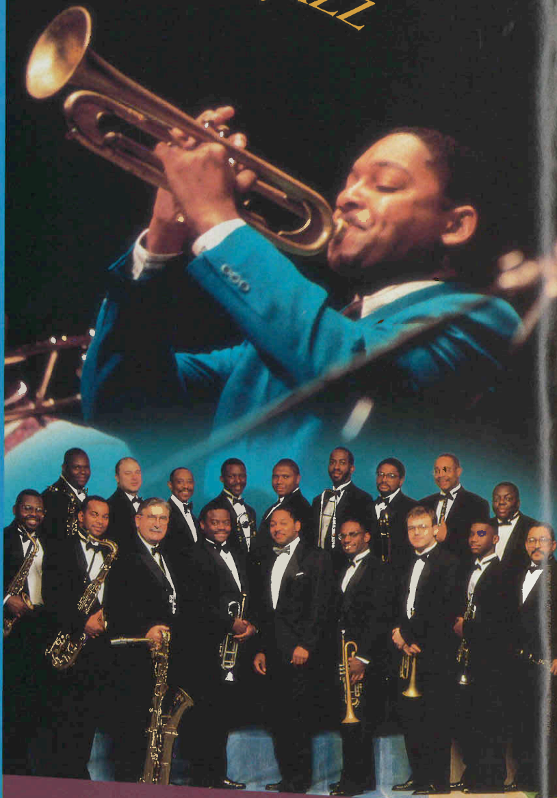
Wynton Marsalis, Artistic Director of Jazz at Lincoln Center and Conductor of the Lincoln Center Jazz Orchestra

There is a world of music out there and NJPAC brings you the best of it: from Portugal, Ireland, Spain, and Africa back to the United States and its most characteristic national music — jazz.